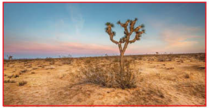
80 ACRES — Perfect spot for a Ranch. Property could be subdivided for sub-division. Possibilities are endless. Utilities on both sides. 60220 Reche Road, Landers. Asking $137,500.