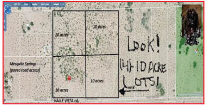
40 ACRES — (4) big 10-acre parcels, all adjacent with views. Parcels APN #0620-271-01, 02, 03, and 04. Put up 4 large ponderosa-style ranches or spec homes. 1234 Mesquite Springs, 29 Palms. Asking $100,000.