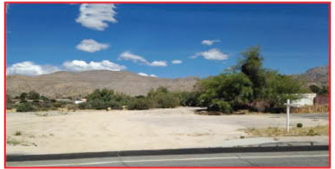
TWO LOTS — Zoned commercial. Recently combined to one. Curbing, sidewalk and driveway aprons in place. 29 Palms Highway, Morongo Valley. Asking $45,000.