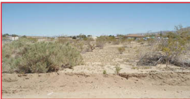
1.48 ACRES — Zoned JT/CINDUS. Near Joshua Basin Water District office with water and power available. 0 Sunset, Joshua Tree. Asking $40,000.