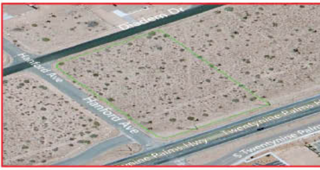
COMMERCIAL PROPERTY — This is 2.33 acres of prime real estate in beautiful Yucca Valley near new Home Depot, and Super Walmart. 0 29 Palms Highway, Yucca Valley. Asking $400,000.