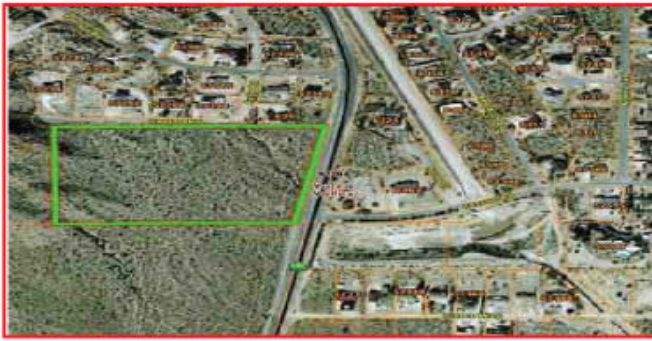
11.73 ACRES — Nicely located overlooking Yucca Valley that is now zoned to allow 1 home per acre. Panoramic views. Telephone on property. Septic Tank. 0 Highway 247, Yucca Valley. Asking $100,000.