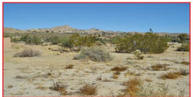
.99 ACRE LOT — Zoned Office/Commercial. With water and power available nearby. 0 Sunnyslope, Yucca Valley. Asking $20,000.