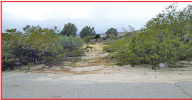
0.227 ACRE LOT — Zoned CG. This property offers nice mountain views. 0 Senilis Avenue, Morongo Valley. Asking $60,000.